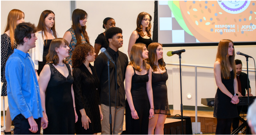
Guests were treated to musical theatre performance by teens from The Chicago Academy for the Arts.